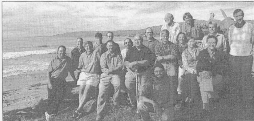
Figure 3: The UCSB faculty and student representative at the 2003 faculty retreat at Coal Oil Point, Goleta, CA.

National Academy of Science. In 2000, the department devoted a considerable amount of time at the annual faculty retreat to developing a mission statement and goals for the next era. The mission statement itself is posted on the department's Web site and has been incorporated into numerous internal planning documents. The original author was Michael Goodchild.