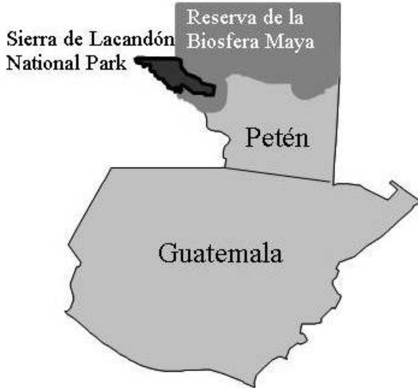
Map 1. The SLNP, RBM, and Petén, Guatemala